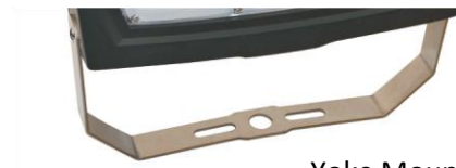
Yoke Mount & Canopy Mount